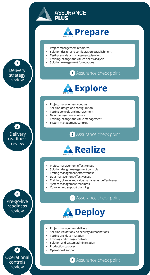
Model 3. Assurance PLUS™

The delivery of Assurance PLUS™ leverages a streamlined team structure with well-defined roles and responsibilities. This focus on agility and rapid assessments ensures efficient execution of the assurance process, keeping pace with the dynamic nature of modern projects.